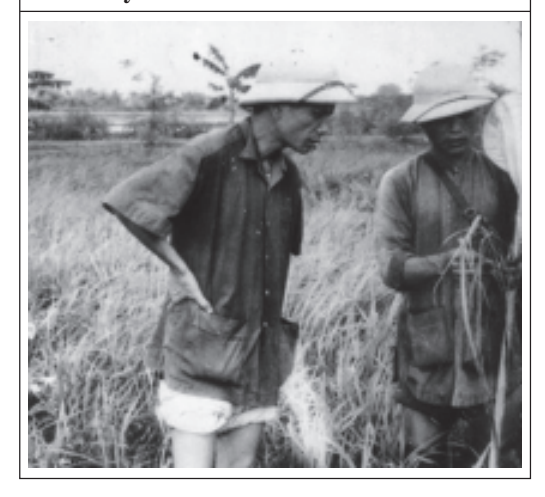
Figure 1: Kim Ngoc (Left), Party Secretary of Vinh Phuc Province 1966-67

The implementation of khoan policy took place during the period of escalated bombing by the US Air Force and severe drought in North Vietnam. However, the right policy generated promising outcome with rice yield for 1967 ranging from 5 to 7 MT/ha. Improved supply of rice also led to a substantial improvement in raising pigs (as popular food for Vietnamese). Collectively, the herd of pigs in Vinh Phuc in 1967 totaled 307,000, a 20% increase from 1966, and 38% higher than 1965. It cost almost nothing.