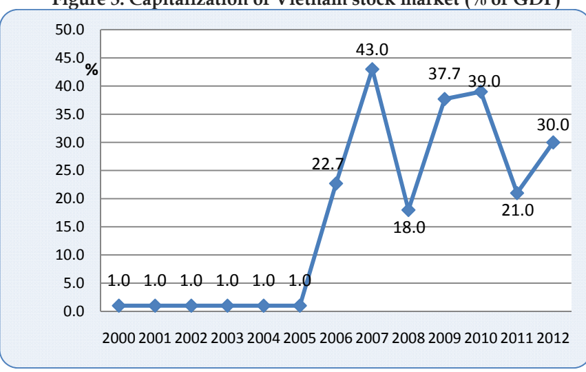
Figure 3: Capitalization of Vietnam stock market (% of GDP)

bubble risks. Despite immense risks, the market continued to go high as capital gains were still made easily, and macro prospects looked bright with Vietnam joining WTO soon (Pham and Vuong, 2009).