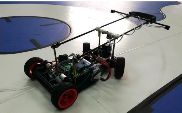
Figure 1. Photo of intelligent car

The intelligent car practice project is designed to train students how to apply their knowledge of circuit design, embedded development and software programming that they have learned in previous course work. In this project, the students must employ the Altium Designer the industrial EDA tool to design the electronic circuits, C language to program the microprocessor, and the Keil MDK the software programming platform to complete the system requirements analysis, system design, system implementation, system integration, debugging and testing. This latter requirement must be done according to the basic project development flow on the hardware platform and model car which is designed and developed as part of the study major. Students must purchase their own components and tools, and then fabricate a smart car that can track, speed test and perform wireless communication, as shown in Figure 1.